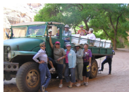
Canyon de Chelly and Monument Valley 2006

Also, mark your calendar for November 5 when we will be making our annual bus tour to the Globe area. In Globe, we will board the newly opened Copper Spike train at the historic depot for an excursion to the Apache Gold Casino and Resort. The day trip will include a visit to the San Carlos Apache Cultural Center and lunch at a restaurant to be determined. As always, suggestions or ideas are appreciated.