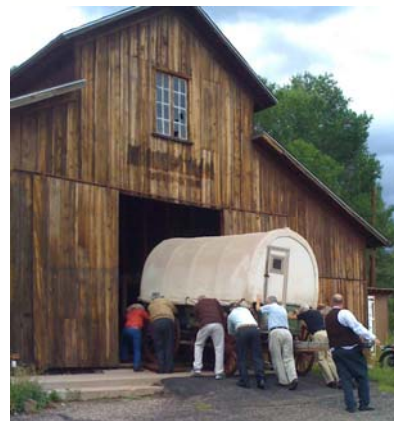
In August, the State Board met at the Pioneer Museum of in Flagstaff. The meeting was held in the barn behind the Museum. To have room for lunch and the meeting, the covered wagon had to be moved outside. Board members help return it to the barn.